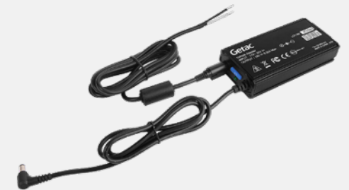
Bare Wire Version