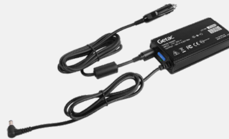
Cigarette Lighter Plug Version